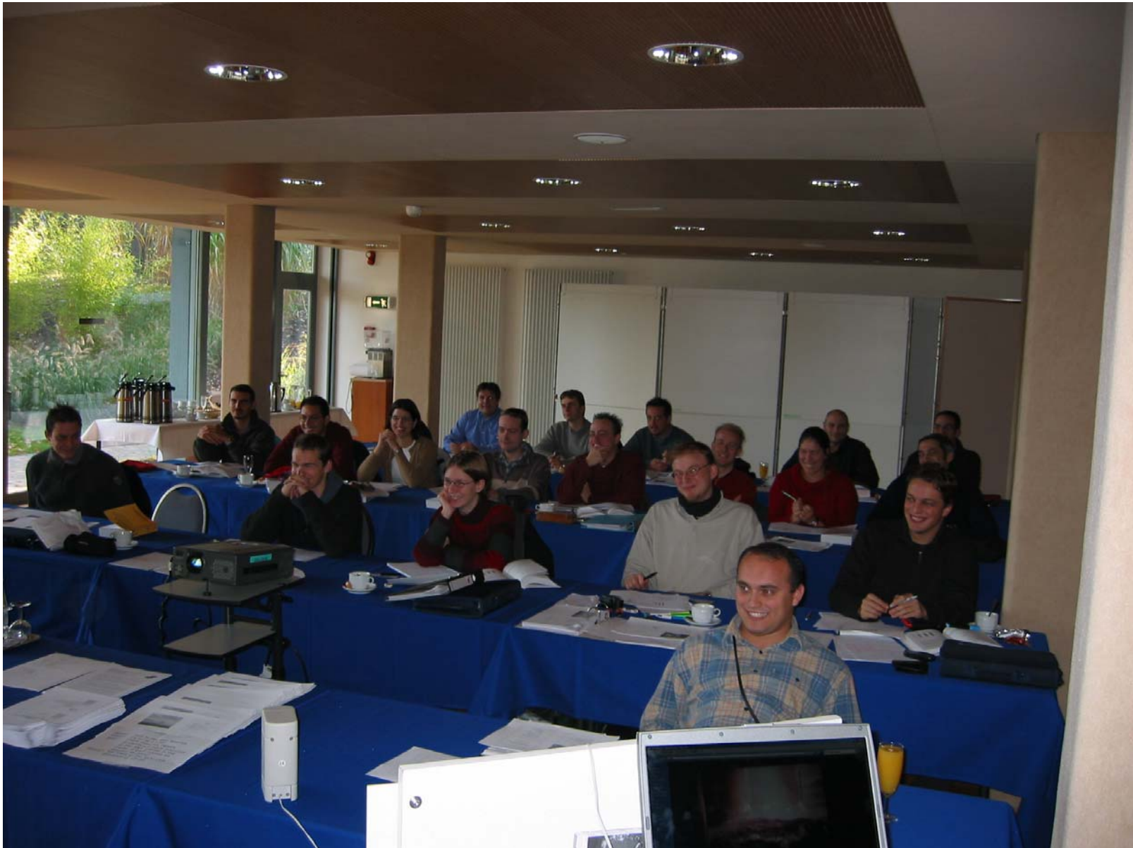
Governing Board and General Assembly Meetings of SNE-TP, 25 - 26 Nov 2008