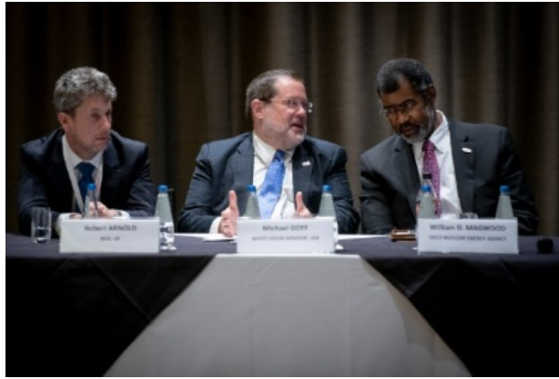
Figure 1: Keynote speakers exchanging at HTR 2018

186 abstracts and 140 papers have been submitted enabling attendees to obtain the latest results and get insight on new orientations and perspectives.