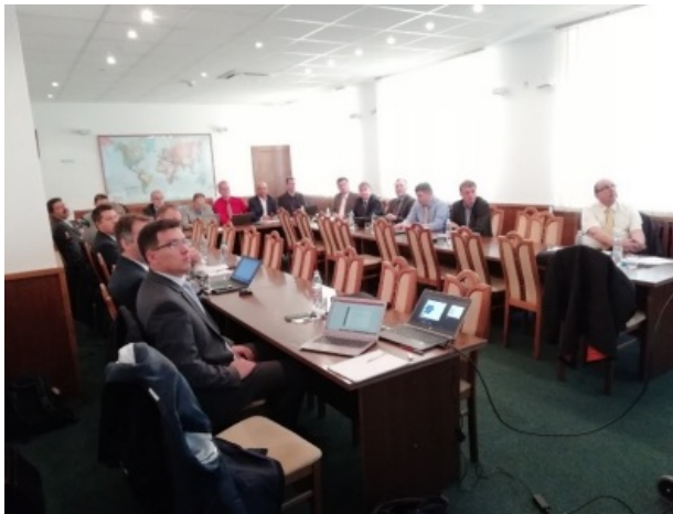
Figure 2: NUGENIA meets with the Hungarian Nuclear R&D Stakeholders